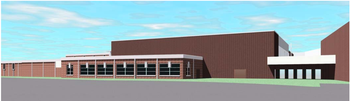
Architect's conception of new athletic/fine arts addition to the high school. East or Highway 65 view.