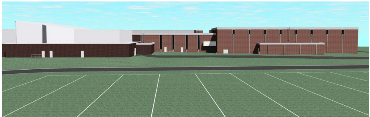
Architect's conception of new athletic/fine arts addition to the high school. From top to bottom: southeast view, southwest view, west view