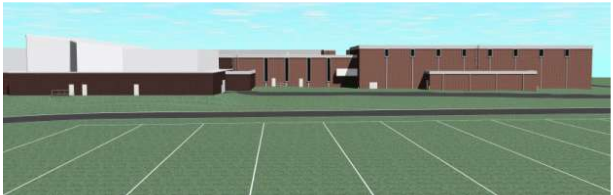
Architect's conception of new athletic/fine arts addition to the high school. From top to bottom: southeast view, southwest view, west view