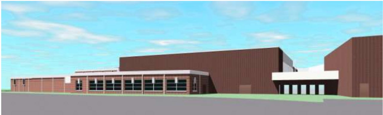
Architect's conception of new athletic/fine arts addition to the high school. East view.

At the Spring Lake Park High School complex site, demolition of the current "Early Childhood Programs" wing will begin in March once the asbestos abatement project is completed. (The district's Early Childhood programs will temporarily move to the new District Services Center in March.)