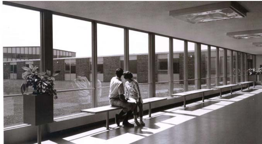
Students admire the courtyard area of the new, 1955 Spring Lake Park High School.

Woodcrest (District 6), Blaine (District 47), Wilson (District 60), Anoka High School, Columbia Heights High School, and Minneapolis' Marshall High School and Jordan Junior High