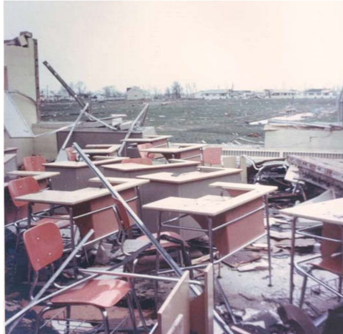
Forty years ago, the May 6, 1965 tornado destroyed much of Woodcrest Elementary and the junior-senior high complex pictured above. School resumed two days later.

The sprawling Clover Leaf Creamery Farms, from whom the land was purchased